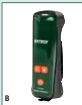
A. Articulating (6mm diameter) camera tip adjusts up to 240° viewing angle with four built-in bright LED lights illuminate dark areas B. HDV-WTX — Optional Wireless Transmitter transmits video to the main display from tight or hard to reach places up to 100ft (30m) away