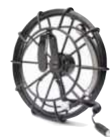
Camera probes with cable length greater than 3m will be coiled on a spool as shown on the left.