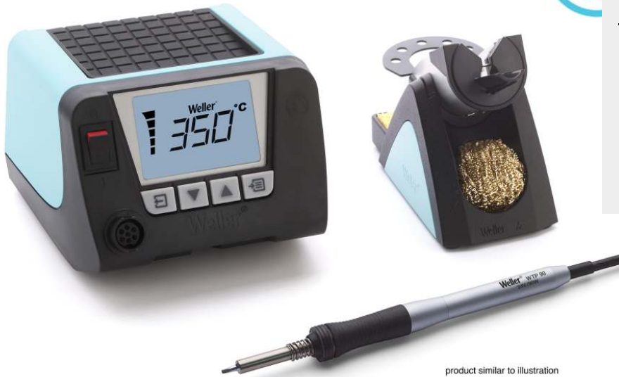
product similar to illustration