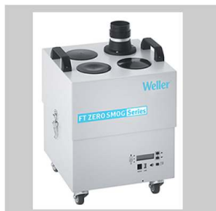
Fume extraction devices