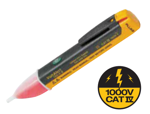
Fluke 1AC II