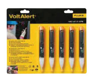
Operating range: 200 – 1000 V AC Batteries: Two AAA Alkaline Size (H): 148 mm Two Year Warranty