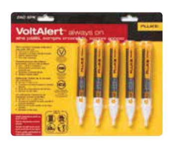
Operating range: 200 – 1000 V AC Batteries: Two AAA Alkaline Size (H): 148 mm Two Year Warranty